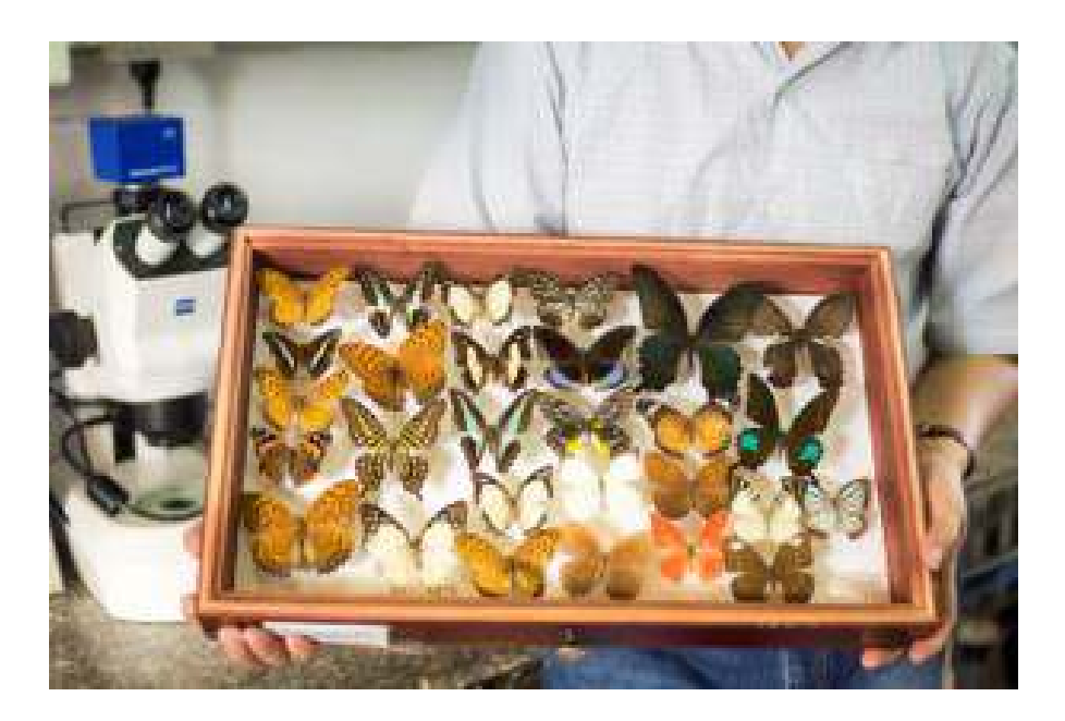
Center for Insect and Parasitology