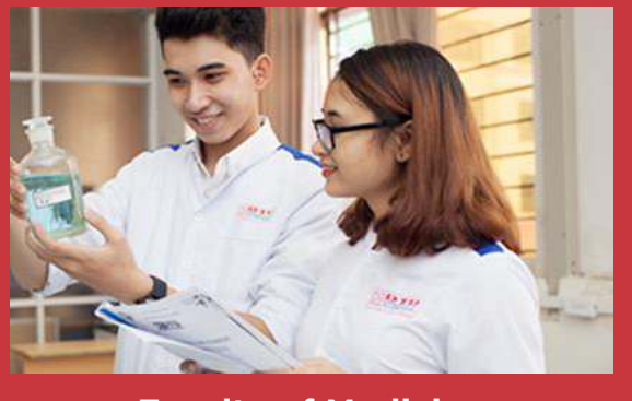
Faculty of Medicine