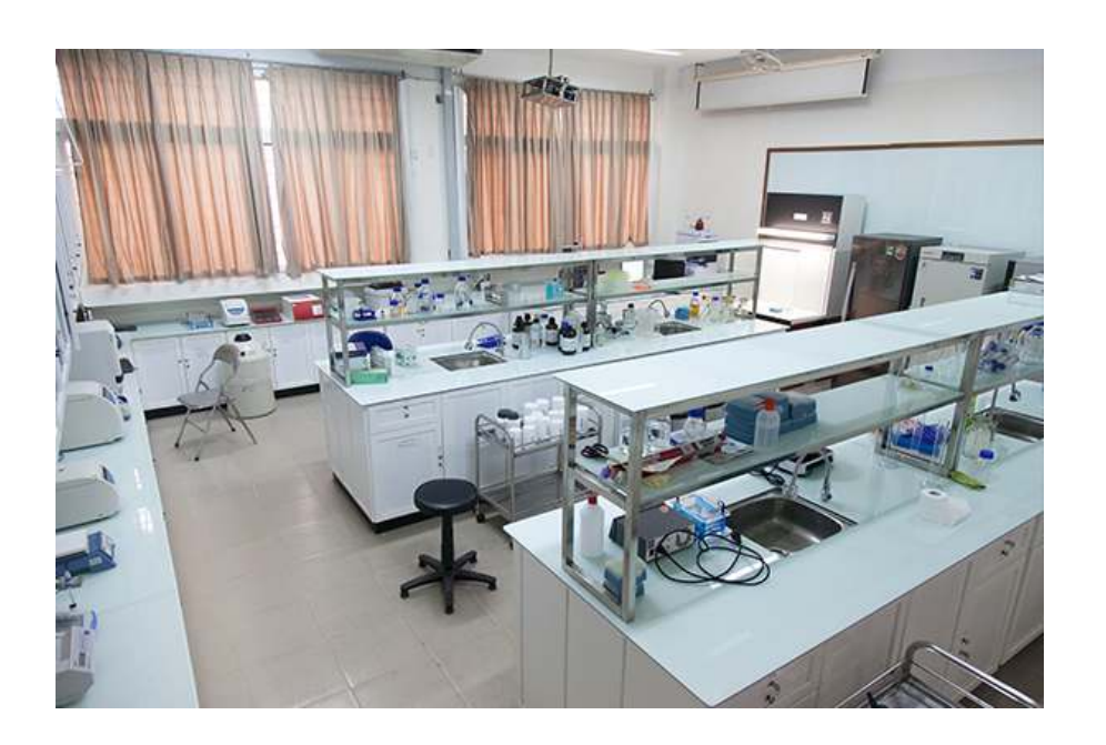
Center for Experiment and Practice